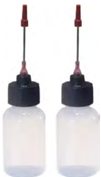
Needle Tip Bottles

https://www.youtube.com/watch?v=hMvUtlIjHY