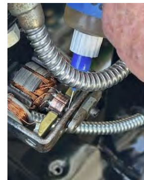
Horn Armature Felts (2)