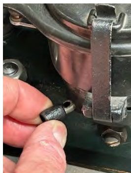
Distributor Oil Cup