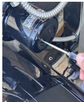
Remove Horn shell