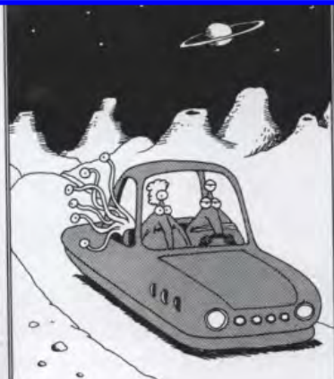
Taking the family pet for a ride

I woke up this morning determined to drink less, eat right, and exercise. But that was four hours ago when I was younger and full of hope.